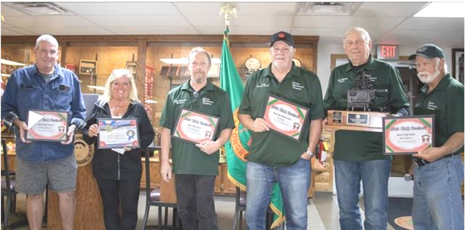
Chili Cook-Off winners left to right: