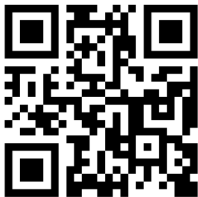
DSC website link for additional event photos

Toys for Tots drop boxes will be in the clubhouse and the shotgun building from Friday Nov.1 until general membership meeting Dec. 4. Please bring a toy to donate when you come to the club or participate in one of our shoots. T4T Shoot flyers are elsewhere in the P & K.